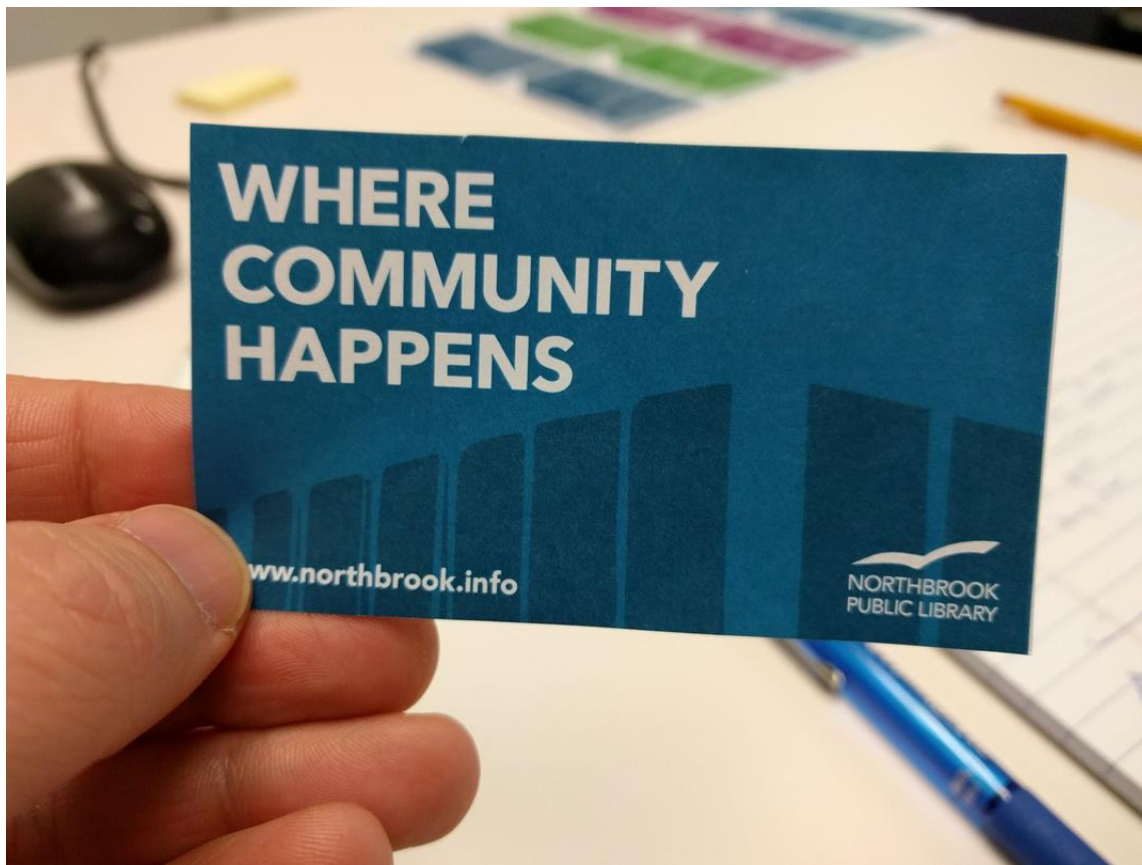
Our new library card and tagline